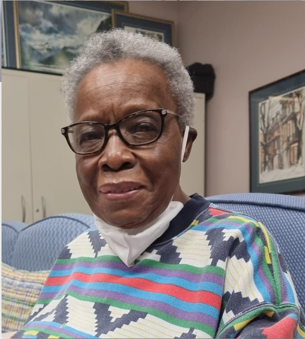
Thornhill Ministerial Lenten Series 2023 Sundays at 4:00 p.m.

Come, Holy Spirit, bending or not bending the grasses, appearing or not above our heads in a tongue of flame, at hay harvest or when they plough in the orchards, or when snow covers crippled firs in the Sierra Nevada.